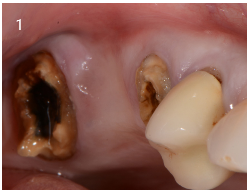
1. Original site.