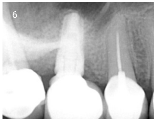
6. Radiograph at 1 year.