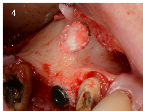
4. Implant placed, window sealed with EthOss ® .