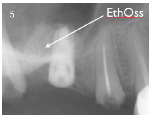
5. Initial radiograph.