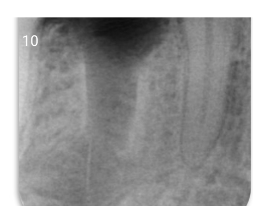
10. Periapical x-ray 1 month postextraction.