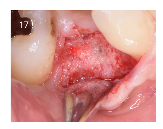
17. Surgical re-entry. After 3 months, the site was covered by newly formed regenerated bone.