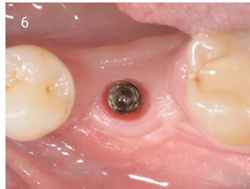
6. Also 10 weeks following implant placement, cap removed to take impression, there was no soft tissue grafting. 75 ISQ reading.