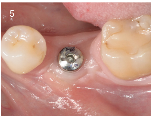
5. Implant placed 10 weeks following graft. Image shows healing at 10 weeks following implant placement.