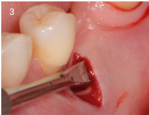
3. Incision distal to 5, periosteum lifted.