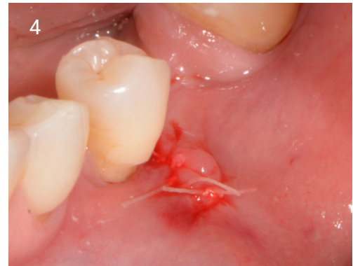
4. EthOss® placed with graft gun and sutured closed.