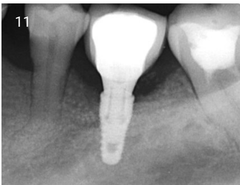
11. Loaded 9 months.