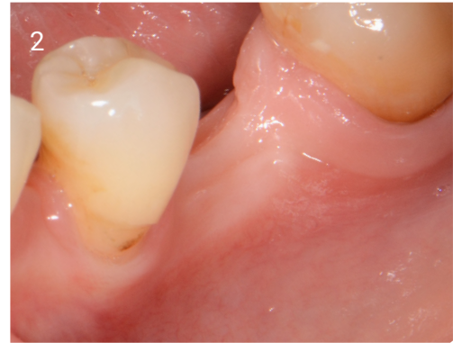
2. Narrow ridge and reduced keratinized gingiva.