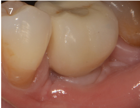
7. Fitted 9 months.