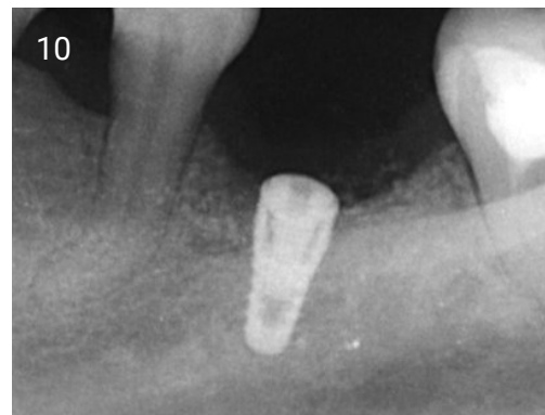
10. Radiograph of implant placed (10 weeks following graft).