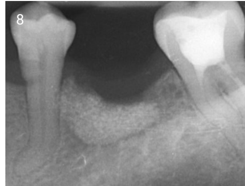
8. Radiograph of graft in-situ.